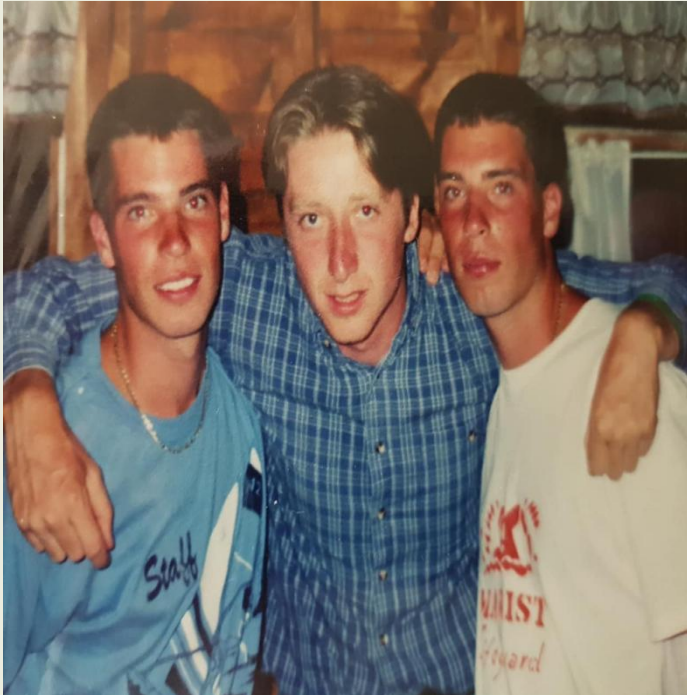
Camp Marist “Good for You”