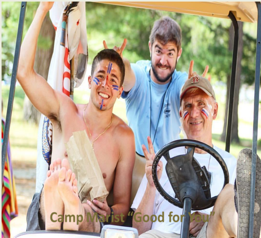
Camp Marist "Good for You"