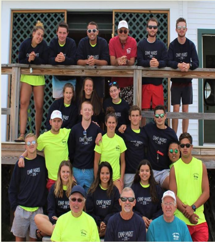
Camp Marist "Good for You"

As a volunteering at Camp Marist from 1968 to 2018 in varying capacities: counsellor, assistant prefect, photography instructor and mostly at the waterfront as life guard, assistant waterfront director, sailing instructor and powerboating instructor.